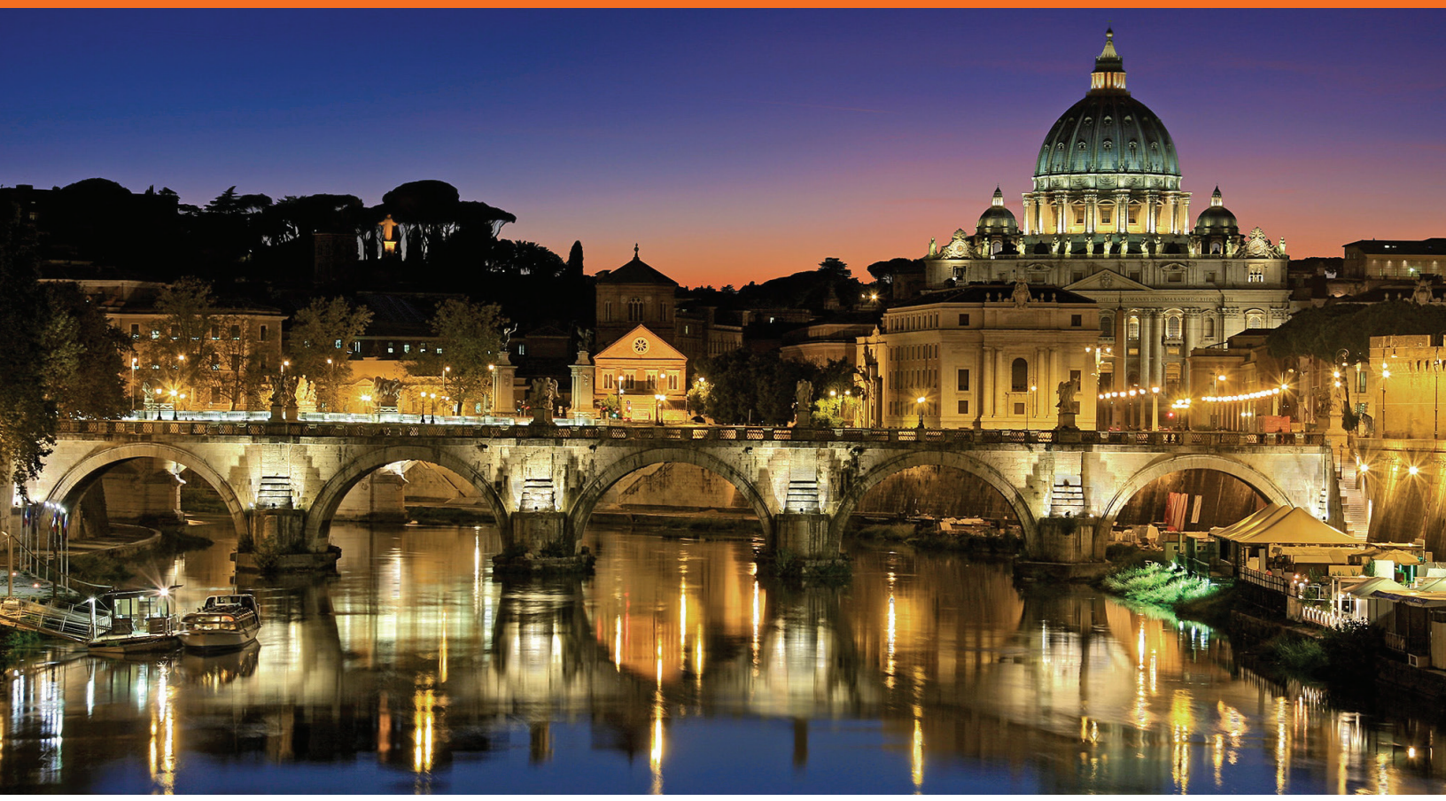
21st Century Rome: Arts and Architecture