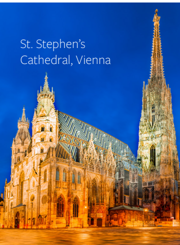
St. Stephen's Cathedral, Vienna